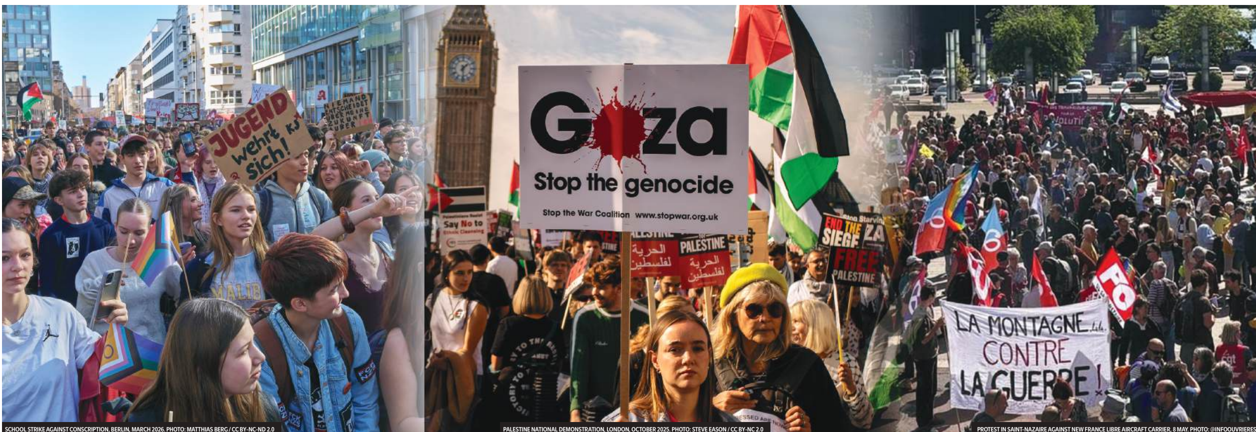
SCHOOL STRIKE AGAINST CONSCRIPTION, BERLIN, MARCH 2026.

The failure of the General Strike to peg back the employers' offensive fed into the horrors of the 1930s: mass unemployment, the hated Means Test that enforced poverty and the rise of fascism and war.