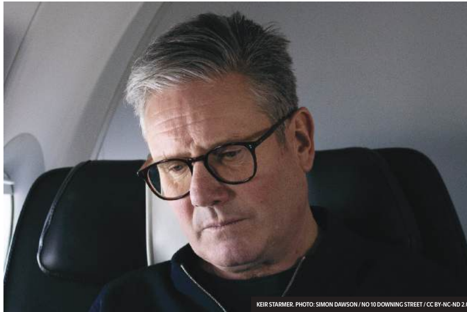
KEIR STARMER.

In stark contrast, Wales' election was absolutely spectacular. The difference there is that the devolved government had been kept in Labour's hands for a very long time by an unusually popular and competent First Minister, Mark Drakeford, who combined a version of the SNP's 'hey, at least it's not London' schtick with just enough economic radicalism to look more progressive next to successive Tory governments. His retirement, coinciding with Starmer's catastrophe of a UK government, caused this once-sturdy output to be destroyed from both inside and out, as his initial successor immediately got embroiled in