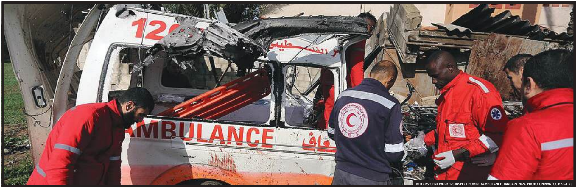
RED CRESCENT WORKERS INSPECT BOMBED AMBULANCE, JANUARY 2024.