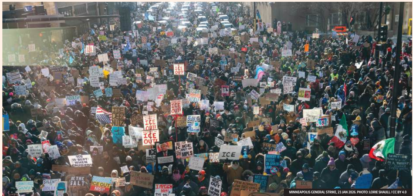
MINNEAPOLIS GENERAL STRIKE, 23 JAN 2026. PHOTO: LORIE SHAULL / CC BY 4.0

We have to do everything we can to stop this happening.