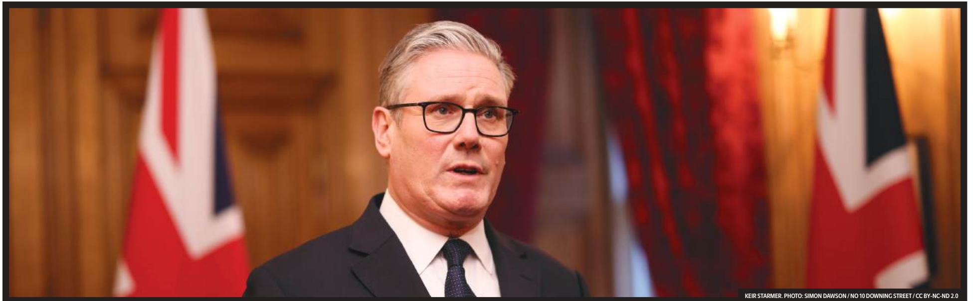
KEIR STARMER.